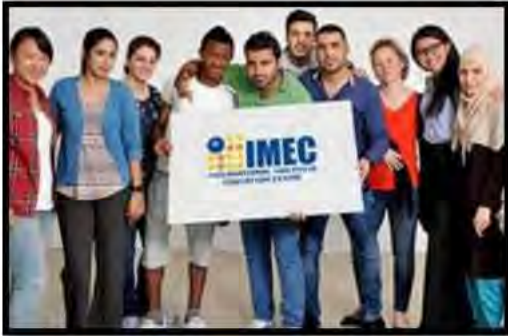
IMEC-UNIVERSITY MALAYSIA SARAWAK LEARNING CENTRE KUALA LUMPUR (UNIMAS Learning Centre KL)

IMEC is a Centre of learning and education offering both academic and professional development programs. We also offer communication and language programs under IMEC Education Sdn Bhd (272915-V) (formerly known as Country Heights Education Sdn Bhd). IMEC, through its affiliation with public and private universities, and credential qualifying agencies, is devoted to excellence in teaching, learning, professional development, and to develop leaders in selected disciplines who make a difference globally. We aim to teach crucial skills that will lead towards success and excellence not only in one's career but also in the whole diversity of life experiences so that our learners become producers of new ideas and knowledge in all areas of business.